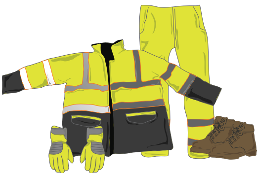
PROTECTIVE OUTER LAYER

This layer protects against rain, snow, and wind. These outer layers should be loose to maintain air spaces for insulation. This layer can consist of water proof gloves and boots, a breathable moisture resistant jacket, and pants that shield you from water and wind.